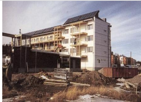
Housing with solar heating in Viikki, Finland vii