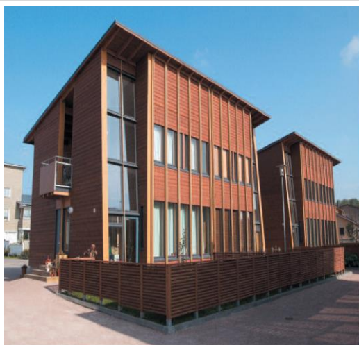
Low-rise apartment buildings, Eco-District Viikki, Finland iii

The Viikki eco-neighbourhood blocks are the result of long-term work aimed at putting ecological principles into practice in actual building. The layout permits functions to be combined naturally, nutrients and water to be recycled (composting, allotments, collecting surface water run-off), and the utilisation of solar energy. The proposals were evaluated using eco-criteria drawn up by an interdisciplinary working group. The eco-criteria define levels of five different aspects: pollution, natural resources, health, bio-diversity and growing food. An environmental profile was calculated for each competition proposal. In this system, points for those five aspects are added up. A zero-points scheme fulfils the strictest minimum criteria for conventional residential building. A ten-point design represents an ecologically excellent scheme and to exceed twenty points requires exceptional innovation.