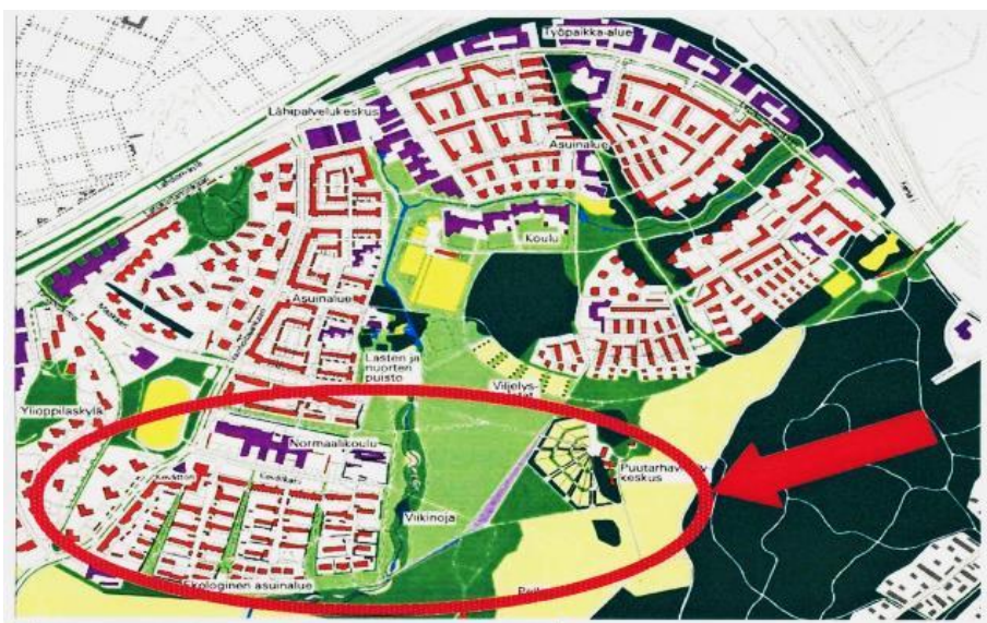
Site plan of Eco-District Viikki, Finland ii

The eco-district in Viikki, Finland is the result of two design competitions plus a number of seminars and debates. The master plan competition was won by a proposal based on a finger-like structure with alternating buildings and green open spaces. The layout permits functions to be combined naturally, nutrients and water to be recycled (composting, allotments, collecting surface water run-off), and the utilisation of solar energy. Another competition was organised for the first blocks. The proposals were evaluated using eco-criteria drawn up by an interdisciplinary working group. The eco-criteria defined levels of five different aspects: pollution, natural resources, health, bio-diversity and urban agriculture. An environmental profile was calculated for each competition proposal. In this system, points for those five aspects are added up. A zero-points scheme fulfils the strictest minimum criteria for conventional residential building. A ten-point design represents an ecologically excellent scheme and to exceed twenty points requires exceptional innovations. i Eco-Viikki is part of the sustainable cities of Europe initiative.