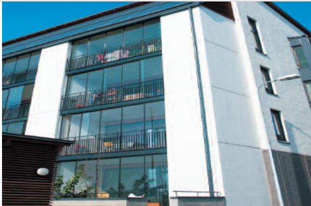
Low-rise apartment buildings, Eco-District Viikki, Finland vi

Lessons. There exists a preoccupation concerning the location of Viikki, since the area is far away from the existing services. Public transport is insufficient as an alternative to private motorised mobility, and continued private car use will eliminated the benefits of residential energy efficiency. This matter needs to be assessed. The solar heating project included in Viikki schemes has been approved for funding under the EU Thermie Programme.