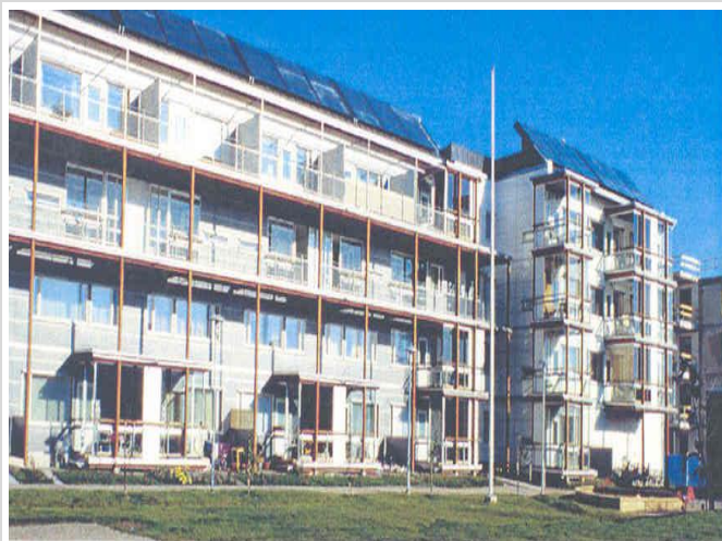
Housing with solar heating in Viikki, Finland iv