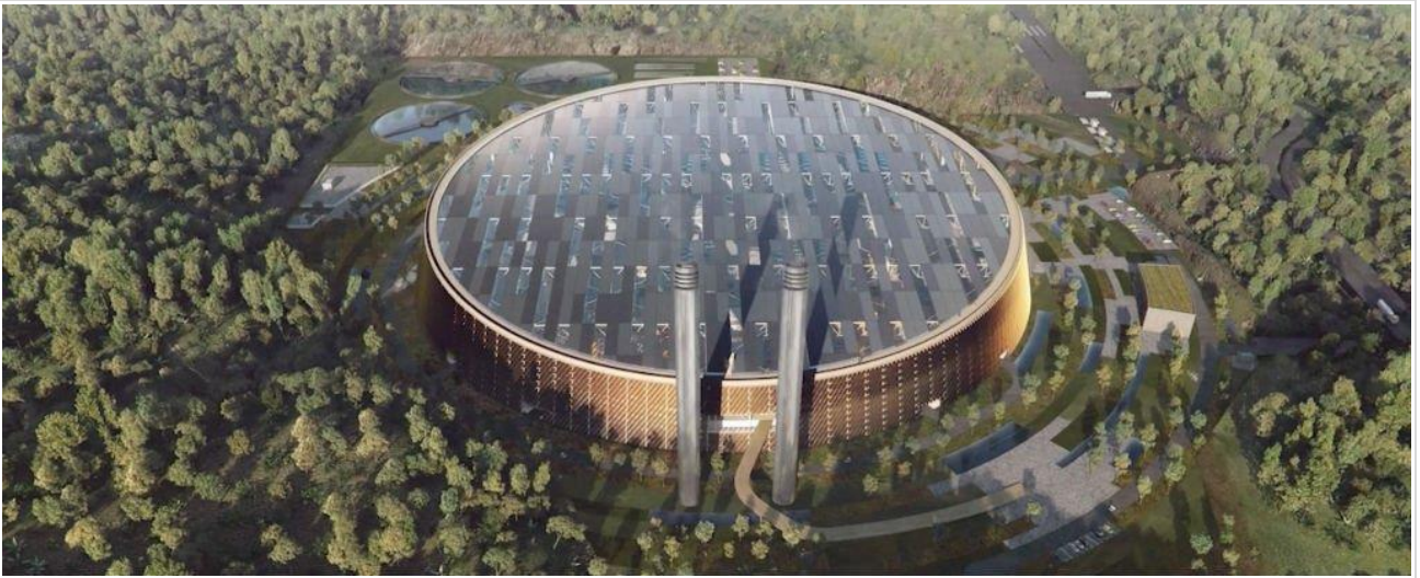
The Chinese city of Shenzhen plans to tackle its serious waste problem by burning 5,000 tonnes of it a day in what will become the largest waste-to-energy plant in the world 2