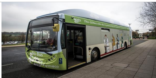
Example of a Bio-Bus in Bath – fuelled with methane recovered from sewage sludge . Source: Atkins

Similar schemes have been initiated around Sweden and now 60% of public buses nationally use fuel from biogas, bioethanol or biodiesel. 4 In the UK pilot biogas to public vehicle fuel pilots have been put in place in the cities of Bristol and Bath