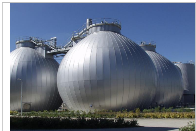
Anaerobic Digestion vessels – the principle means of sludge treatment and energy recovery.

source that can be converted to useful products such as energy and fertiliser / soil conditioner. This is something in common with the wet components of municipal solid waste, food processing waste and some agricultural waste. These materials can be combined and biologically digested to yield gas; dried and combusted to yield heat; or part dried and then put through gasification or pyrolysis to produce both gas and heat.