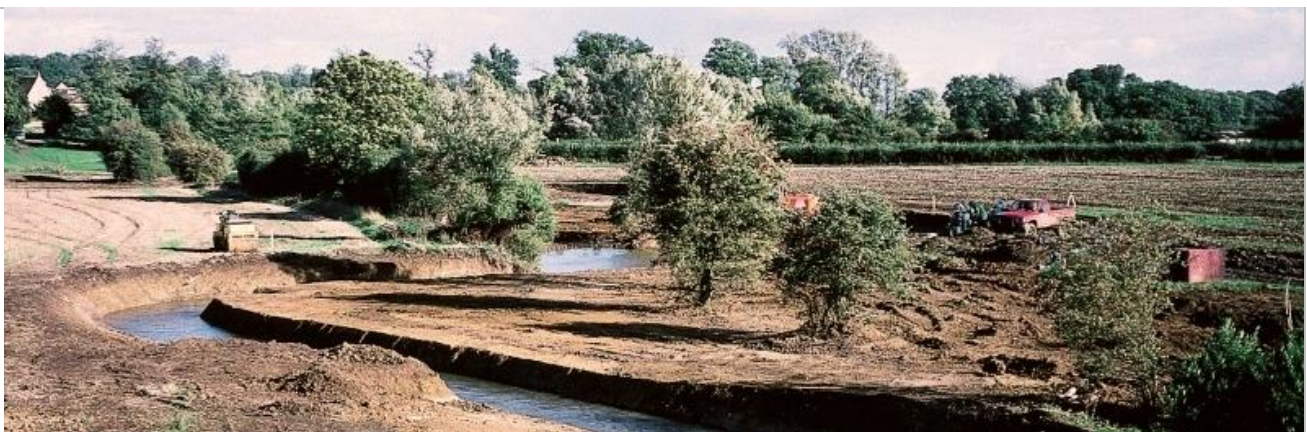
Reconstruction of the meanders 2

Background. 1 The river has a long history of modifications and already the Domesday Book of 1086 has a record of a mill in Coleshill. On the earliest map from the area, dated 1666, the river appears to have been straightened for milling. The section downstream of the mill has more recently been enlarged to safeguard agricultural production from flooding. Until the late 1700s, the mill was fed by a small artificial channel carrying water from the Cole, but by 1818 the mill leat had been largely extended to take the entire flow of the Cole, and most of the old river course filled in. This type of historical management is typical of many other rural rivers in the United Kingdom.