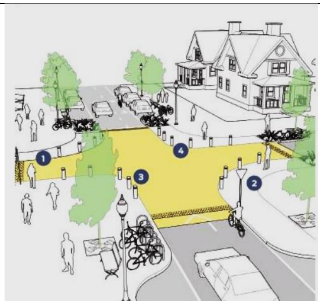
Raised intersections make walking safer iii