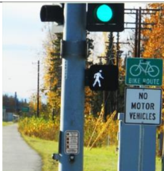
Signal with push button activator ii